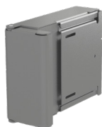
Remote lock with temperature monitoring