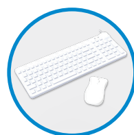
Medical keyboard & mouse