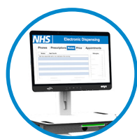
Infinity all-in-one PC