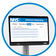
Infinity all-in-one PC