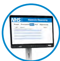
Infinity all-in-one PC